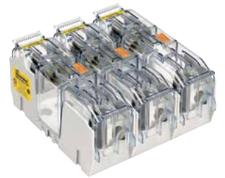
Optional covers enhance safety with IP20 finger-safe protection and lockout/tagout capability.