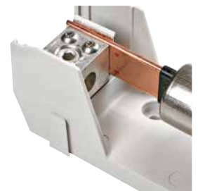
Standard with fuseclip reinforcing springs enhance electrical contact.