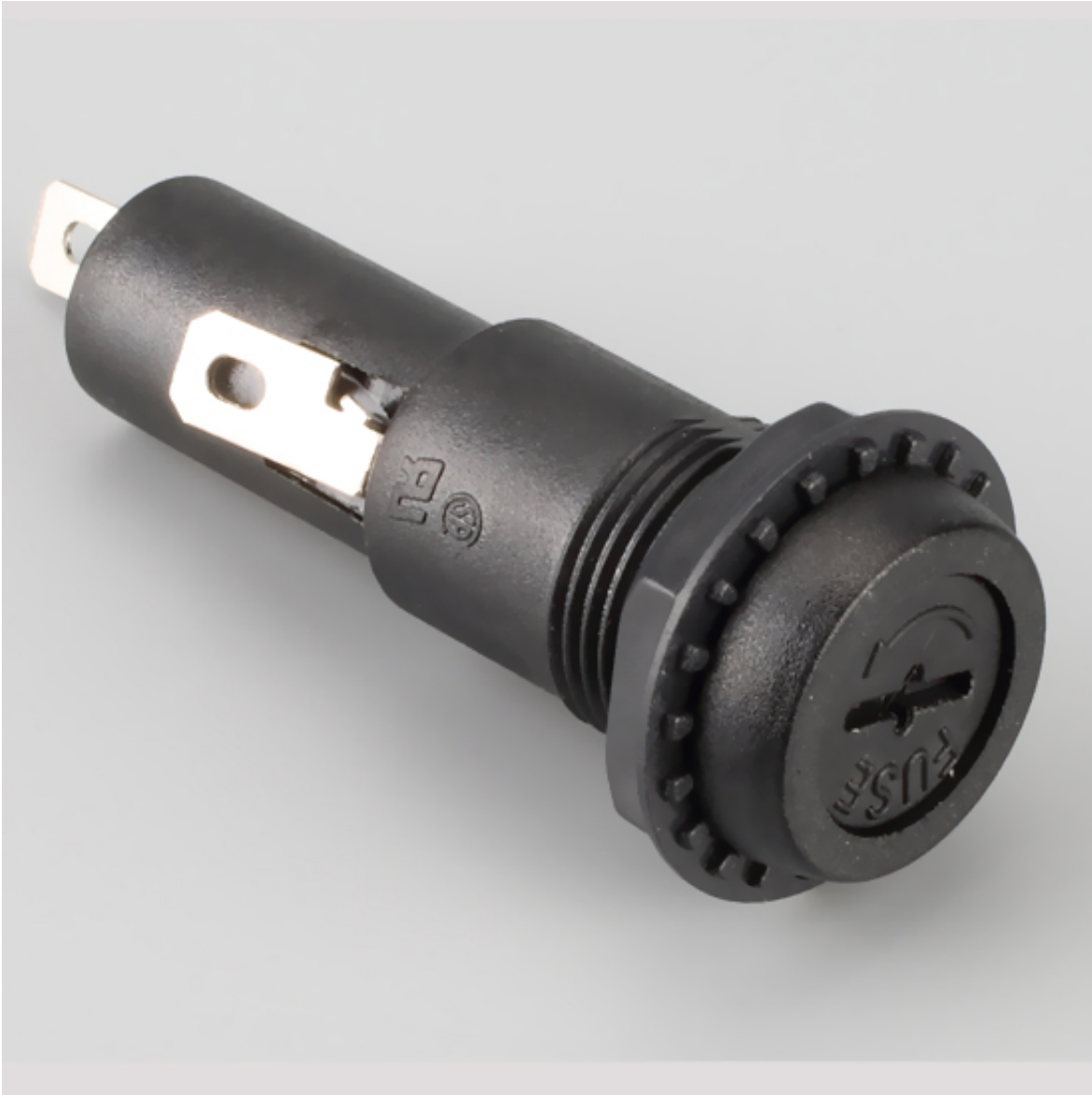
cap panel mount fuse holder